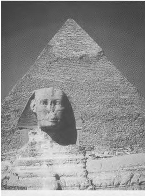
Left The Sphinx and the Pyramid of Chefren at Giza