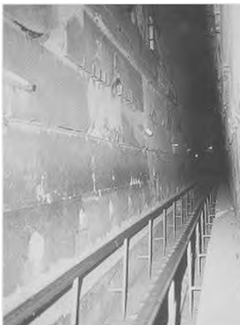
Right The Grand Gallery in the Great Pyramid